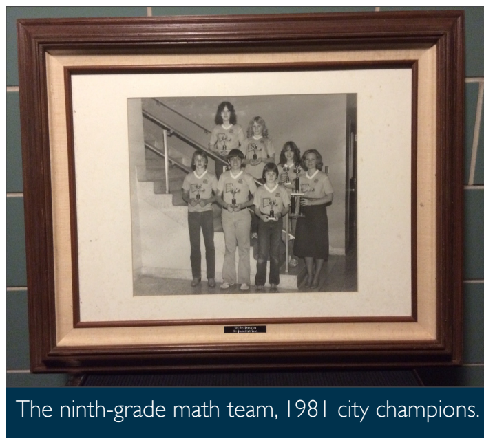
The ninth-grade math team, 1981 city champions.

After returning to Hutcheson as a faculty member in 2014, she avoided the band room for as long as she could. She wanted to preserve the memory she had of what the room looked like when she was a student. She made it until May – just a few weeks before the end of school – before she finally had to go in.