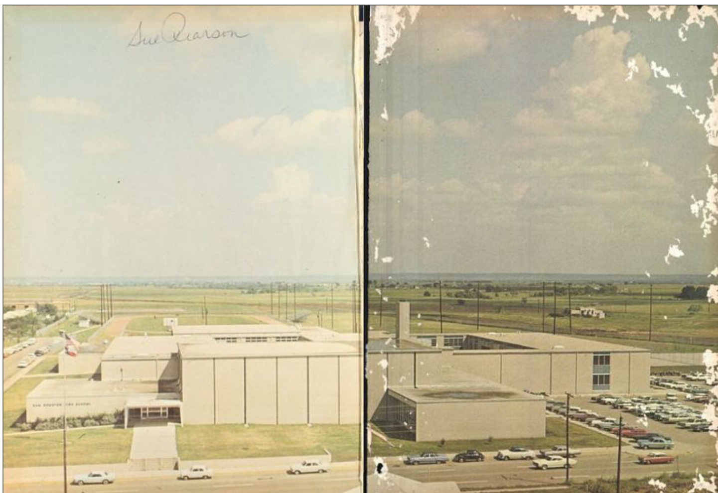
A photo of Sam Houston High School in the 1966 yearbook.