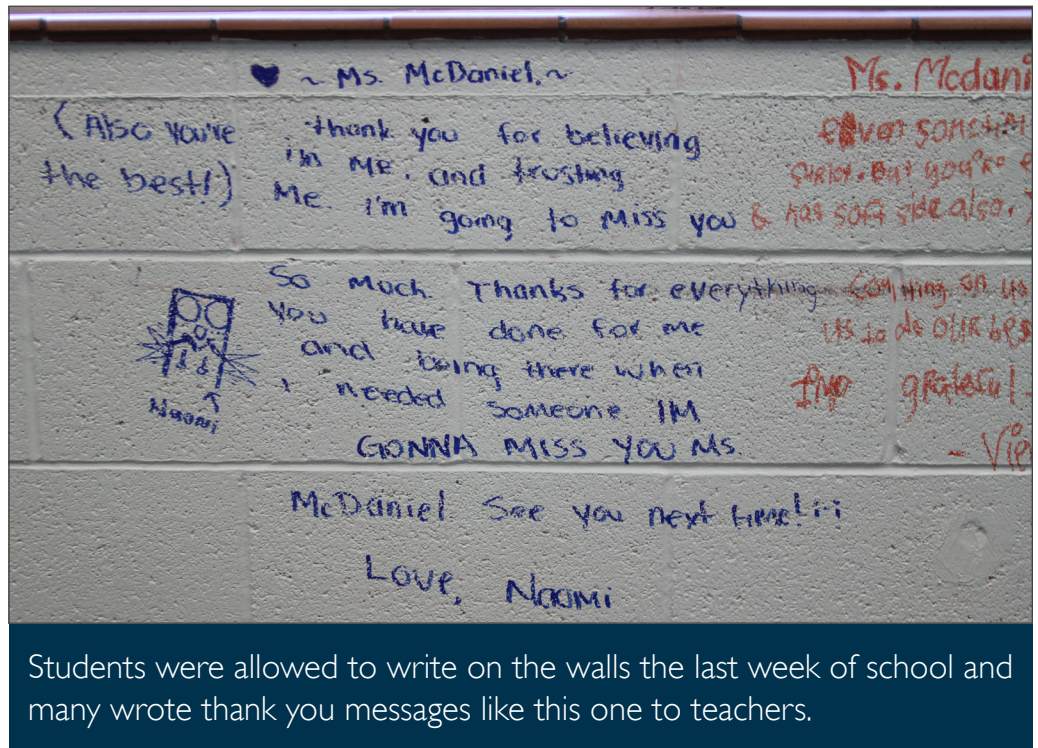
Students were allowed to write on the walls the last week of school and many wrote thank you messages like this one to teachers.