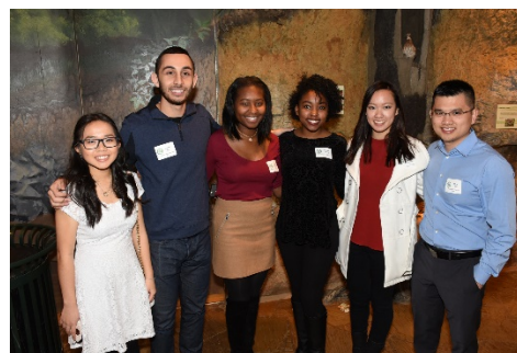
Sequin Alumni at 20 th Reunion 2018