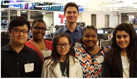
2018 Visit to NBC 5