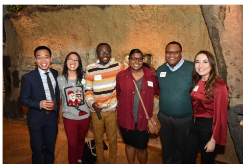
Bowie Alumni at 20 th Reunion 2018

Upon enrolling in college, you will notify the Texas Rangers about your selected university and they will arrange to have $2,500 annually sent to that university to be placed in your account. You must maintain a minimum 3.0 GPA per semester and send a letter at the end of each semester highlighting your college experiences and how the scholarship has aided you thus far.