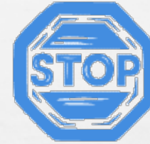
BLUE STOP SIGN

DO NOT HAVE PROPER PREREQUISITE OR TEACHER APPROVAL