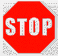
RED STOP SIGN

DO NOT HAVE PROPER PREREQUISITE OR TEACHER APPROVAL