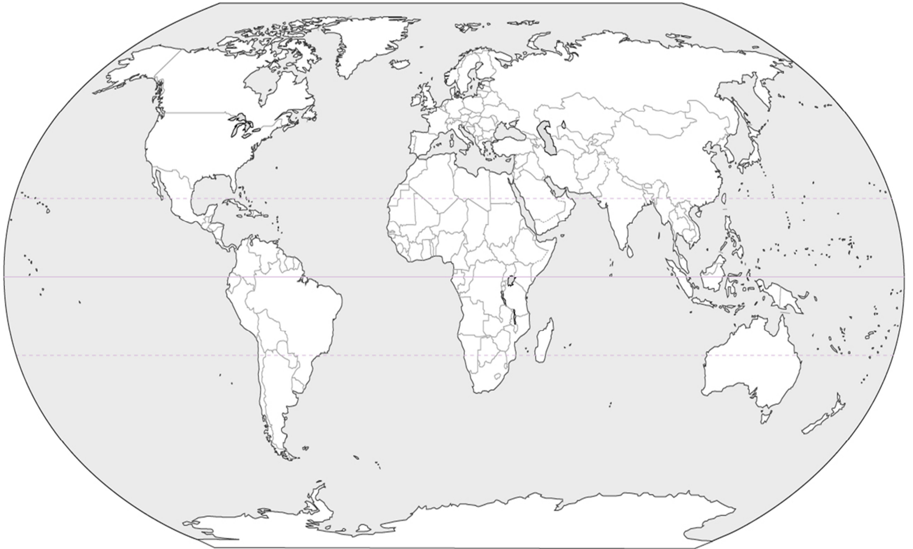
Map #1-World Political Map