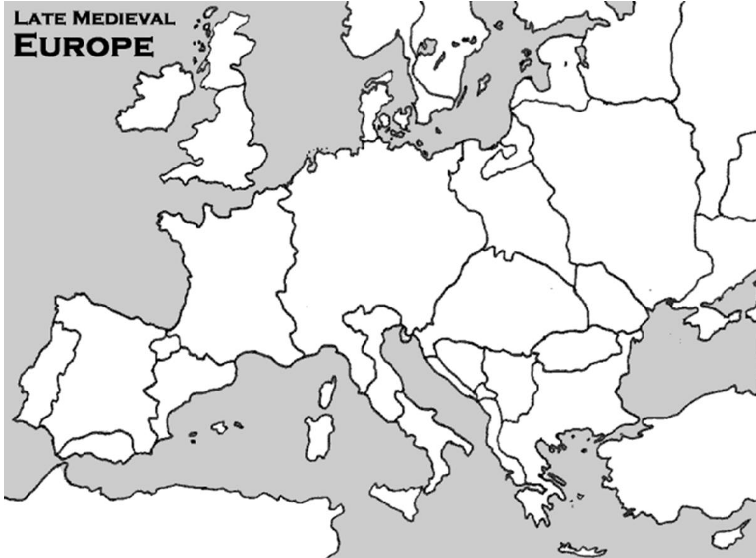
Map #3: Middle Ages Empires Map