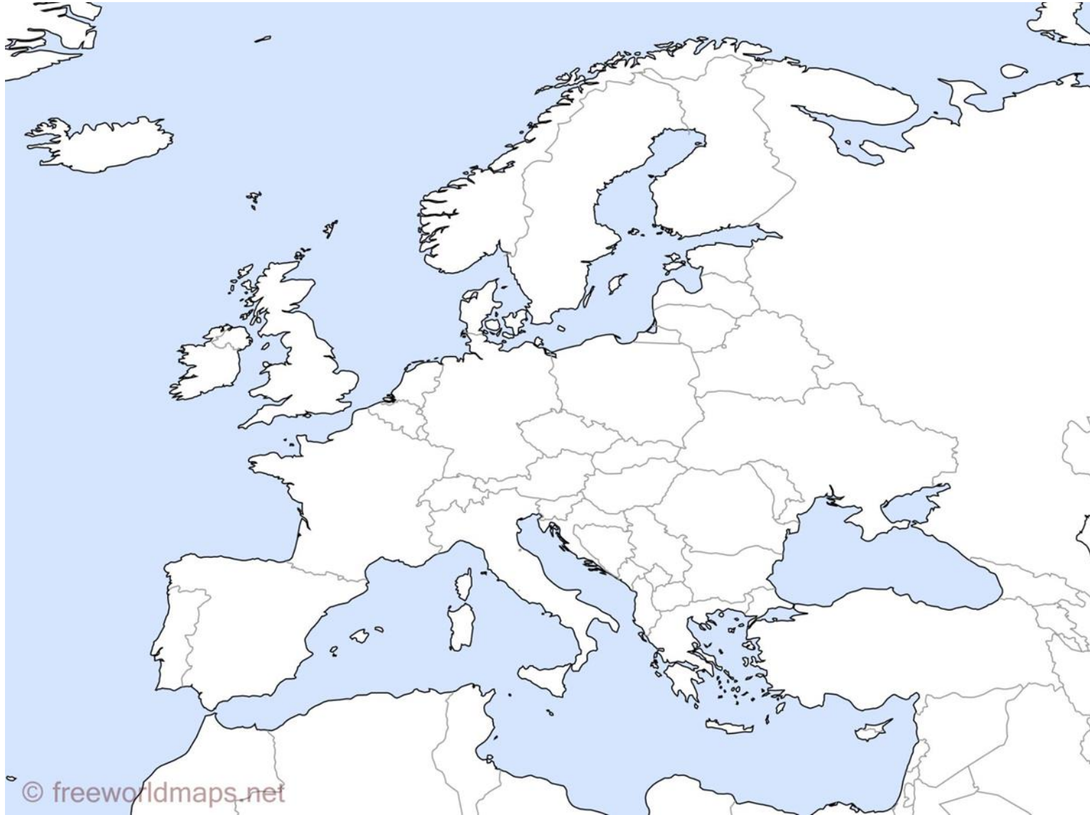
Map #1: Political Map of Europe