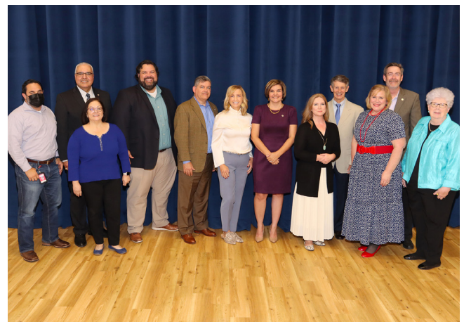
Current and former AISD Board of Trustees members