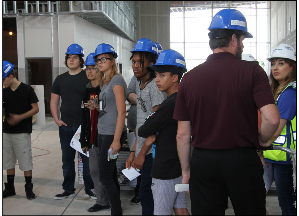
Students from Lamar and Martin were able to tour the Dan Dipert CTC.

Though most of the work at Jones is finished, construction continues into the summer at many campuses throughout the district. The largest of these projects is the Career and Technical Center, which now has a namesake as well. The AISD Board of