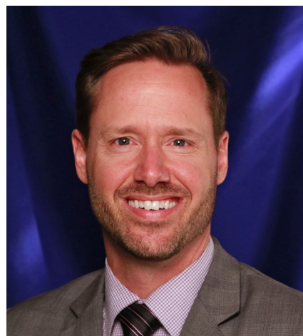
THE LEARNER'S EXPERIENCE

place in the days of the calendar. It's when we stand at the finishing point of one chapter in our learning journey and at the same moment at the threshold of great things to come.